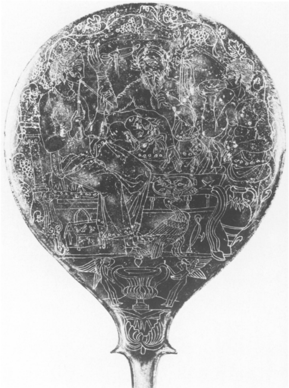
DETAIL OF PLATE IB, LEFT; SEE ALSO FIG. 4.