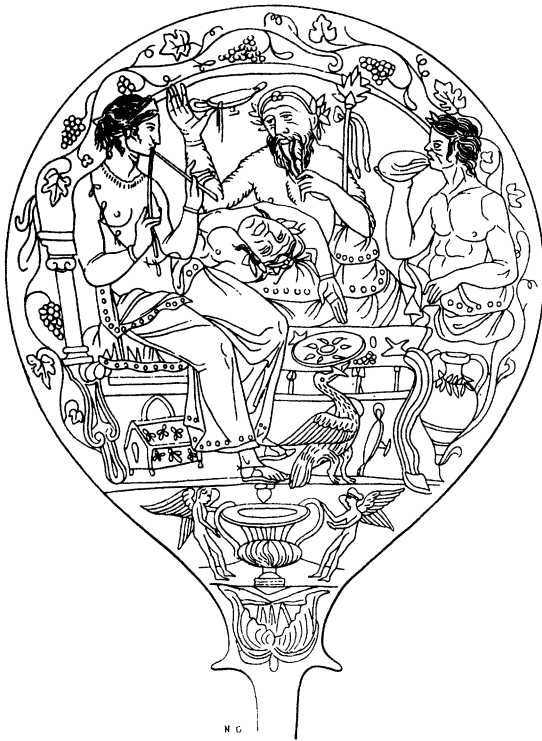
FIG. 4. PRAENESTINE MIRROR (SEE PLS IB, II): DRAWING FROM ETR. SPIEGEL V, TAF. 43.

At this point we return to the Praenestine mirrors, and in particular to a pair, dated to the late fourth or early third century B.C. and clearly from the same workshop (Pl. Ib), which are engraved with related scenes. 74 The first, now in Baltimore (Pl. II; Fig. 4), shows a Dionysiac scene surrounded by a vine with grapes. To the left, a flute-girl. To the right, with an amphora ready to hand, a young man, apparently naked, blows into a conch-shell(?); he is not garlanded, and two little horns appear from his hair. In the centre, a man with a garland on his head sprawls on the cushions, clearly dead drunk, while behind him, evidently trying to revive him by pouring wine on him from a kylix, is a garlanded and bearded figure with a thyrsus in the crook of his left arm. He seems at first to be hairy, but the left forearm and right wrist show that he is wearing a tight-fitting hairy costume. 75 He looks rather sad; and the young man and the flute-girl seem to have somewhat disapproving expressions.