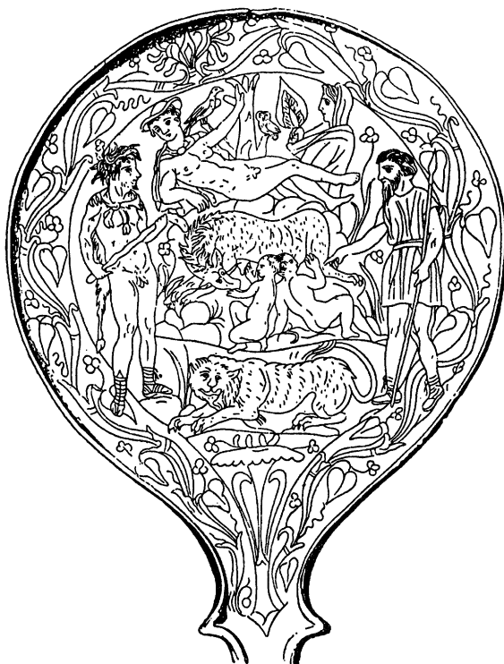
FIG. 2. PRAENESTINE MIRROR, FOURTH CENTURY B.C. (ETR. SPIEGEL V. 172; R. ADAM AND D. BRIQUEL, MEFR(A) 94 (1982), 33-65): ON THE LEFT, PAN LYKAIOS?

A much more elaborate scene, dated to the third quarter of the fourth century (Fig. 2), evidently shows the Lupercal myth itself, with a she-wolf in the centre suckling human twins. 41 To the left stands a male figure, naked but for boots and a goatskin loosely knotted round his neck by the forelegs; 42 he is wild and unkempt, and carries a lagobolon , the shepherd's throwing-stick. I think he is Pan. The contemporary iconography of Pan in his