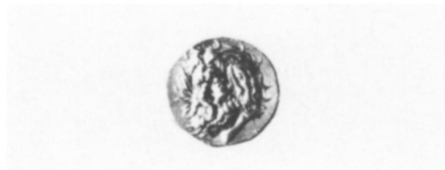
A. FOURTH-CENTURY B.C. COINS OF (LEFT) THE ARCADIAN FEDERATION AND (RIGHT) PANTICAPAEUM ON THE BLACK SEA: PAN IN HUMAN FORM WITH LAGOBOLON , AND AS A WILD MAN.