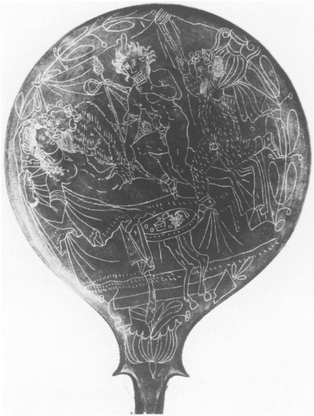
DETAIL OF PLATE IB, RIGHT.