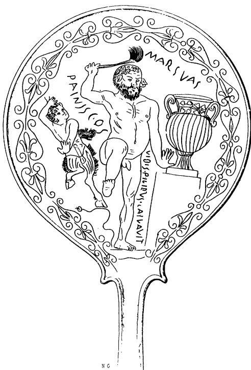
FIG. 1. PRAENESTINE MIRROR, THIRD CENTURY B.C. (ETR. SPIEGEL V. 54, TAF. 45; ILLRP 1201; ROMA MEDIO-REPUBLICANA 290-2): PANISKOS AND MARSYAS.

An interesting contemporary sidelight on Eratosthenes' Roman Pan is provided by a series of engraved bronze mirrors from Praeneste. A third-century example (Fig. 1) portrays a sprightly little ithyphallic goat-legged Pan, labelled 'PAINSSCOS' for Paniskos, dancing with 'Marsuas' the satyr; 39 Marsyas was a figure of some importance in Rome, the legendary ancestor of the gens Marcia and the symbol of libertas , with his statue in the Forum. 40