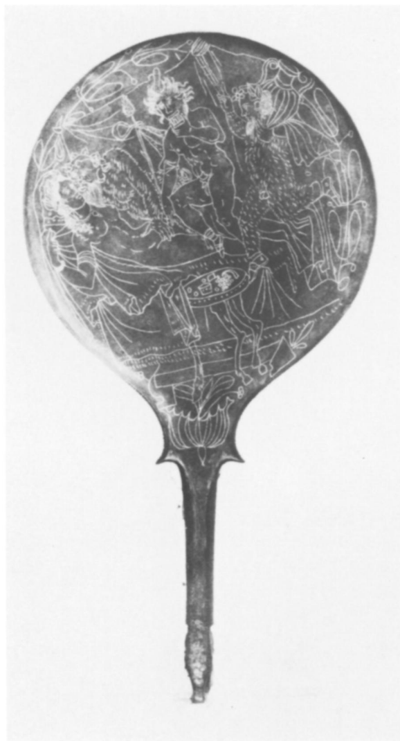
B. PRAENESTINE MIRRORS, LATE FOURTH OR EARLY THIRD CENTURY B.C. (ETR. SPIEGEL V. 51-3, TAF. 42-3). SEE RESPECTIVELY PLS II AND III.